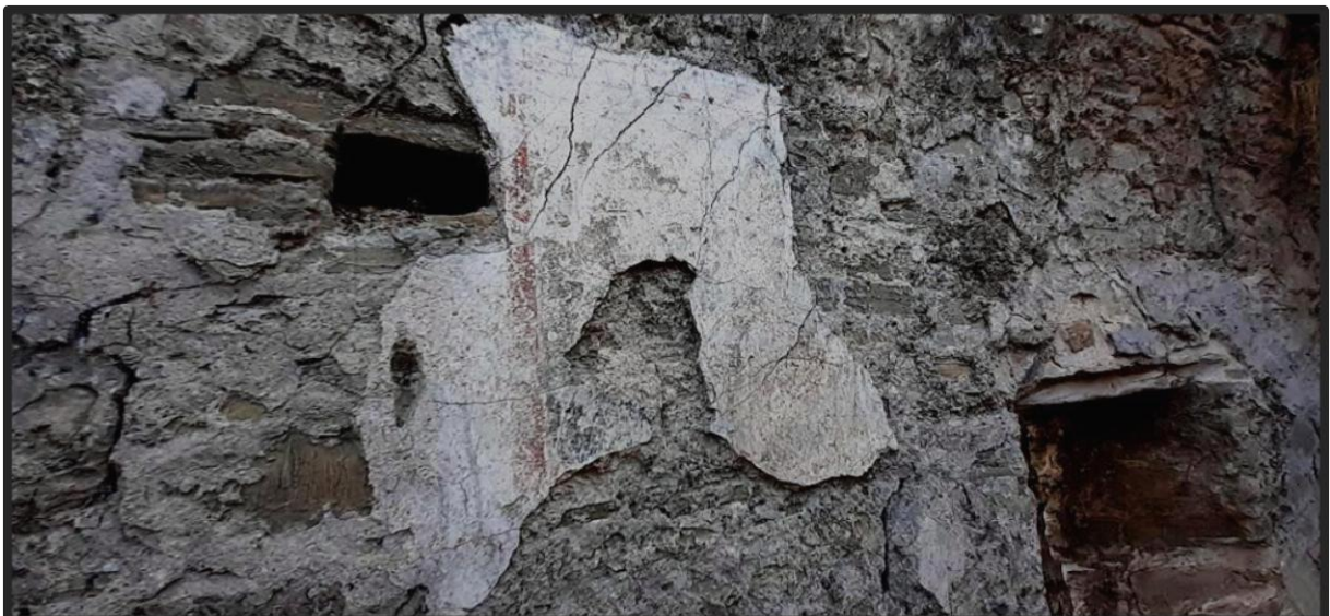
Part of the original wall