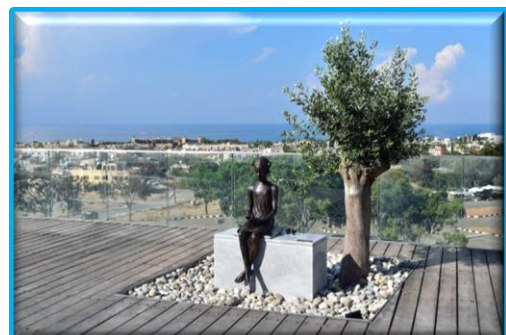
Girl with the birds