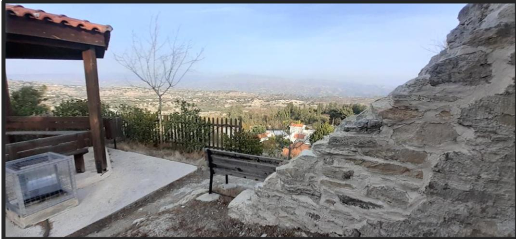
View from the top